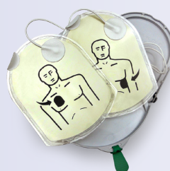
Pad-Pak and Pediatric-Pak with pre-attached electrodes.

Low cost of ownership. With a shelf life of four years from date of manufacture, the Pad-Pak offers significant savings over other defibrillators that require separate battery and pad units.