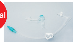
Simulated gastric fistula catheter