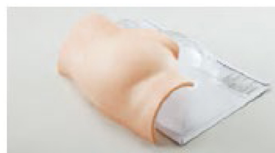
Use as a stand alone unit