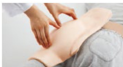
Correct injection site by palpation