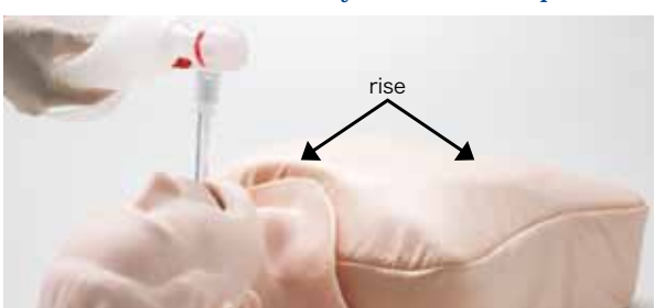
When correctly intubated and ventilated, you can confirm the left and right chests rise.