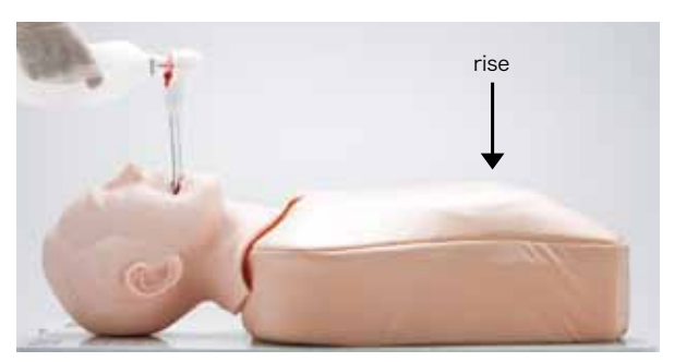
When the tracheal tube has been mistakenly intubated into the esophagus and air is sent, the abdomen will rise, making it possible to confirm the error (stomachinflation).