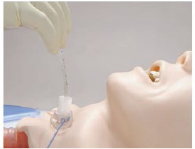
Suction of secretions in the tracheal cannula