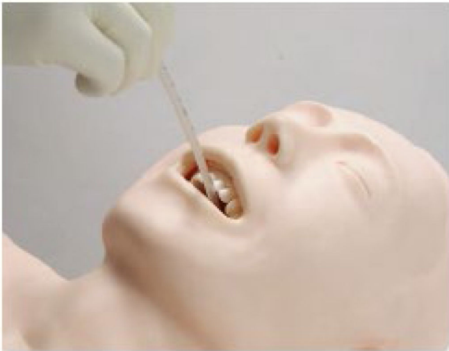
Suction of secretions in the oral cavity

Various Types of Suction Training are Possible