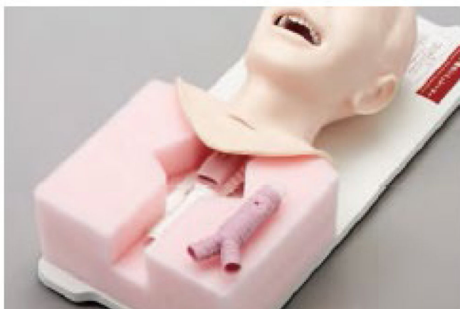
Washing of the bronchi