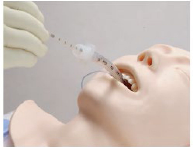
Suction of secretions in inserted tubes