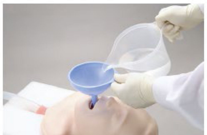
Washing of the oral cavity